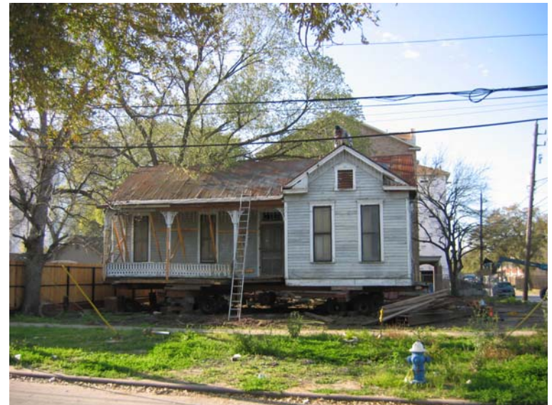
TAJAN HOUSE AT ITS ORIGINAL LOCATION.

TO PREVENT DEMOLITION IN 2006 (DATE OF COMPLETION FALL 2007)