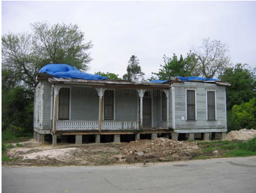
TAJAN HOUSE UNDERGOING RESTORATION AT CURRENT LOCATION